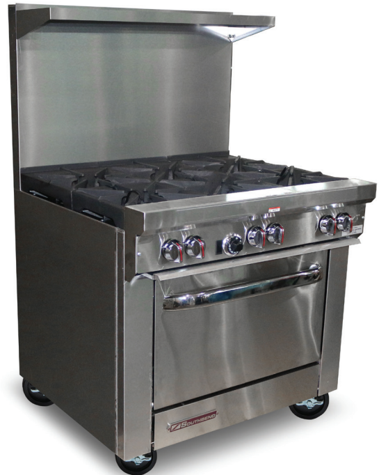
(S36D shown with optional casters)

S36D - 6 Open Burners, Standard Oven S36A - 6 Open Burners, Convection Oven S36C - 6 Open Burners, Cabinet Base