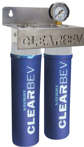
CBE-TW with two CBE-2200 cartridges

ClearBev by VIZION™ brand is an economical solution to water filtration that does not compromise on quality or performance. The CBE series of systems is interchangeable with the legacy Everpure® products while meeting or exceeding their performance standards.