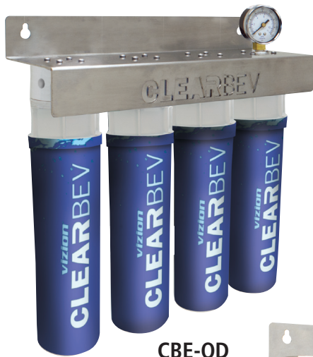
CBE-QD with four CBE-2200 cartridges