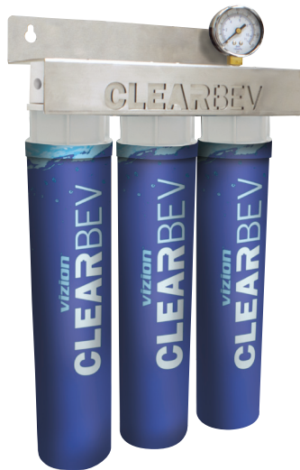
CBE-TR with three CBE-3200 cartridges