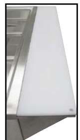
EST-240/PCB 9" Cutting Board

Warranty: This product is protected by Admiral Craft Equipment Corporation's one year limited warranty. Should your product fail under normal use it will be repaired or replaced up to one year from date of purchase.