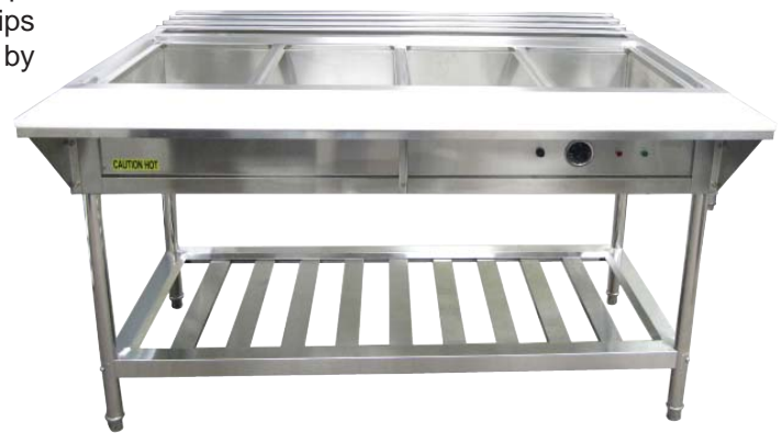
EST-240 shown with optional cutting board and tray holder